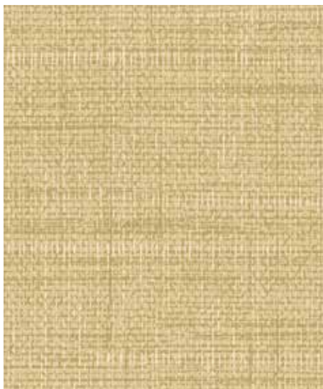
Gold Canyon Dust