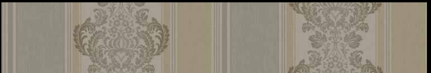
KP10706 shown at 108" wide (2.74m) HALF DROP