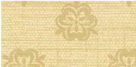
Gold Canyon Dust