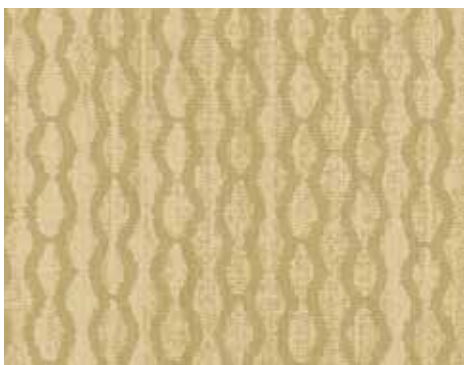
Gold Canyon Dust