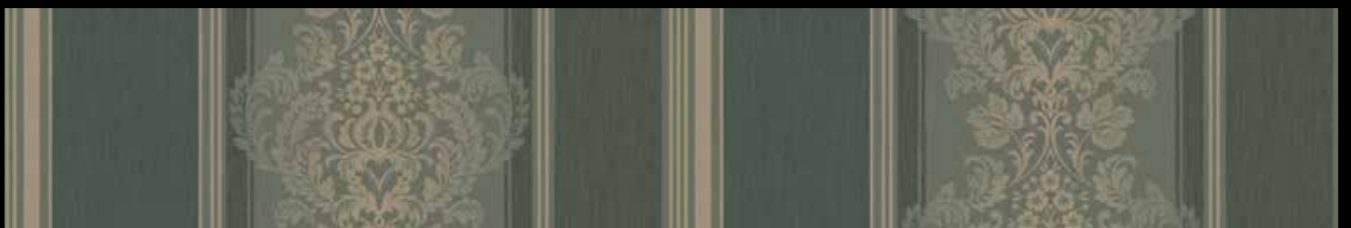
KP10700 shown at 108" wide (2.74m) HALF DROP