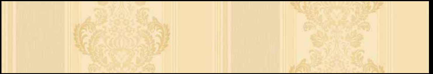
KP10703 shown at 108" wide (2.74m) HALF DROP