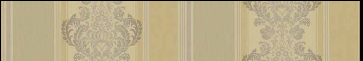
KP10705 shown at 108" wide (2.74m) HALF DROP